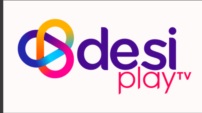
OK logo usage on White/Light BG