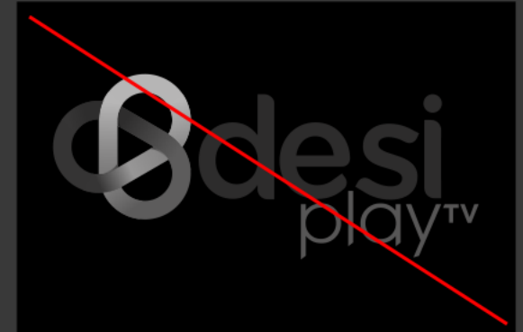
DO NOT use color logo as grayscale on black background