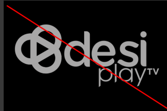
DO NOT use gray logo on black background