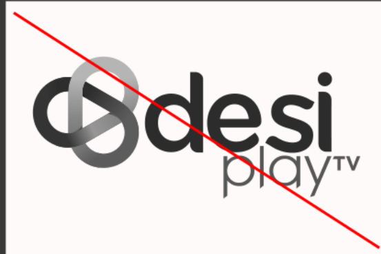
DO NOT use color logo as grayscale on white background