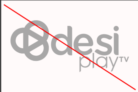
DO NOT use gray logo on white background